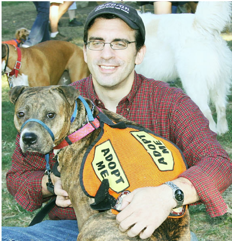
December's Dog of the Month Rosie: Sometimes they Come Back

Those of you who regularly attend the Coffee Bark have met Rosie, my latest foster dog. She's the quiet brindle mix in the orange "Adopt Me" vest attached to the tall handsome guy (that being me). Remember to go to www.mightymutts.org for more information about her and other dogs and cats in our care. Rosie's story is especially sad because she had to be rescued twice. I remember when I first met her. She was 8 months old and had just been rescued a couple of days before from a backyard breeder in New Jersey. This man was notorious for breeding purebreds and mixes in filthy conditions, selling puppies